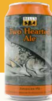
TWO HEARTED® ALE American IPA • 7.0% Grapefruit and pine aromas balanced out with medium bodied malt sweetness