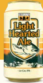
LIGHT HEARTED® ALE Lo-Cal IPA • 3.7% Refreshing, easy-drinking and full flavored, with citrus aromas