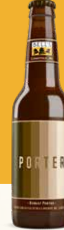
PORTER Robust Porter • 5.6% Medium-bodied with mild chocolate and coffee notes