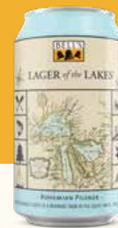
LAGER OF THE LAKES® Bohemian Pilsner • 5.0% Crisp bitterness and herbal hop aromas