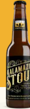
KALAMAZOO STOUT™ American Stout • 6.0% Smooth, full-bodied with dark roasted malts