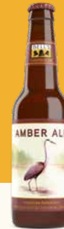
AMBER ALE American Amber Ale • 5.8% Balanced with toasty malt and herbal, citrusy hop aromas