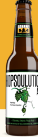
HOPSOLUTION® ALE** Double IPA • 8.0% Tropical fruit, citrus and resinous hop aromas